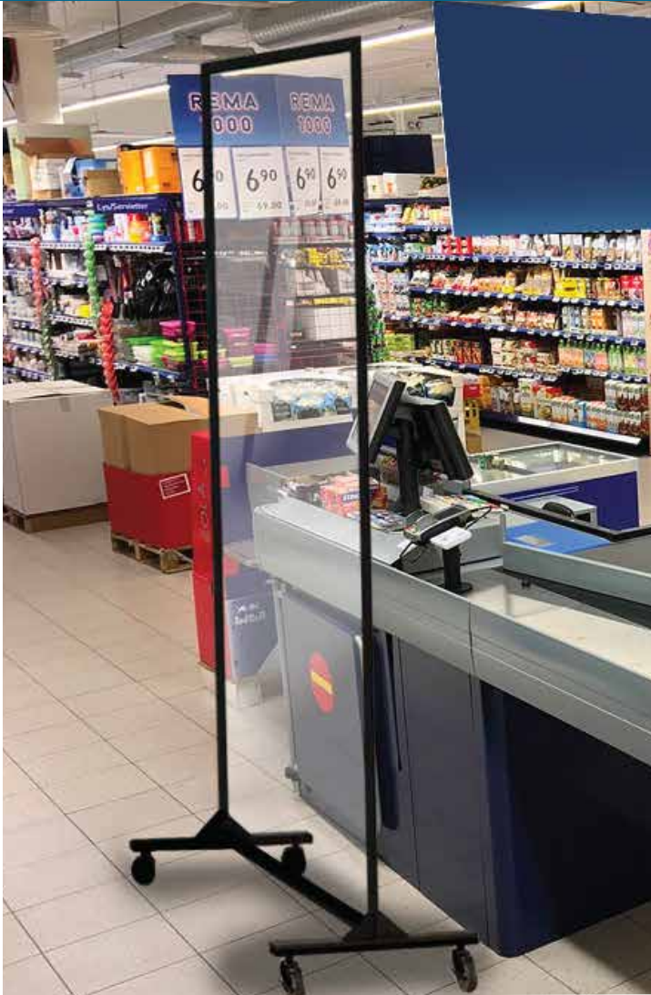
CUSTOM ACRYLIC RETAIL PROTECTIVE BARRIERS